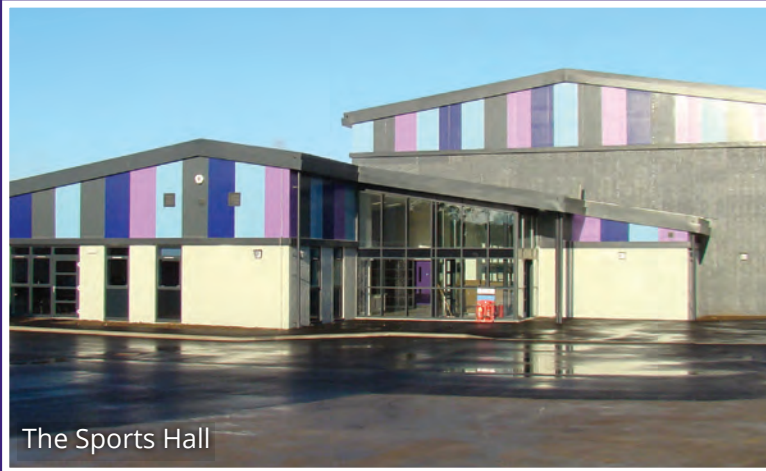
The Sports Hall