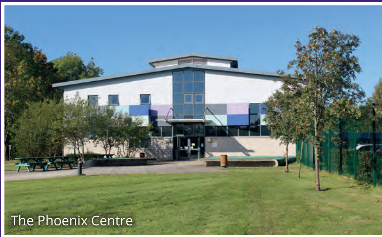
The Phoenix Centre