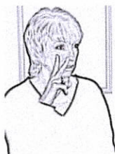
SEE -YOU- LATER