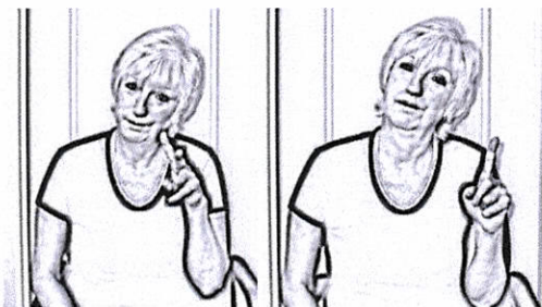
SEE YOU LATER