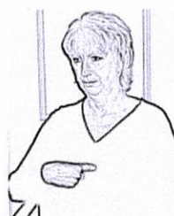
ME Fingerspell or sign name to reply