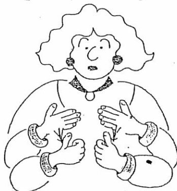
How are you?