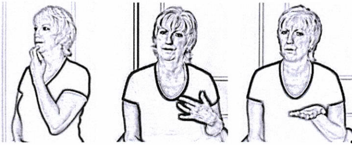
AUNT/UNCLE LIVE WHERE? Where does your aunt/uncle live?