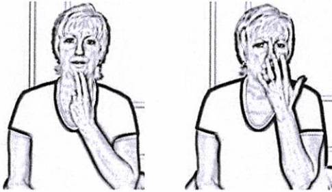
NIECE/NEPHEW HOW OLD? How old is your niece/nephew?