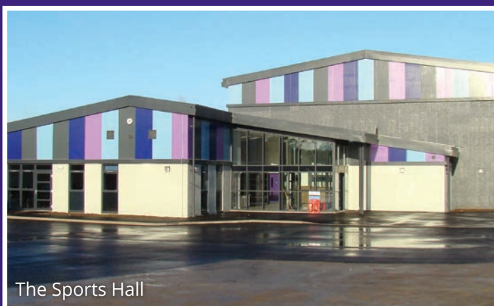
The Sports Hall