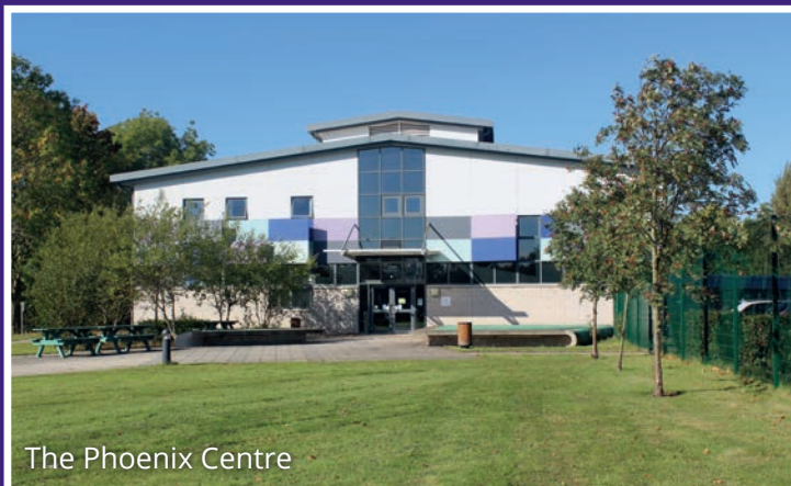
The Phoenix Centre