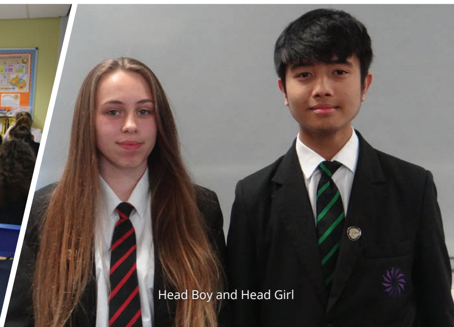
Head Boy and Head Girl

"Teachers have good subject knowledge which they use to provide a solid foundation for learning."